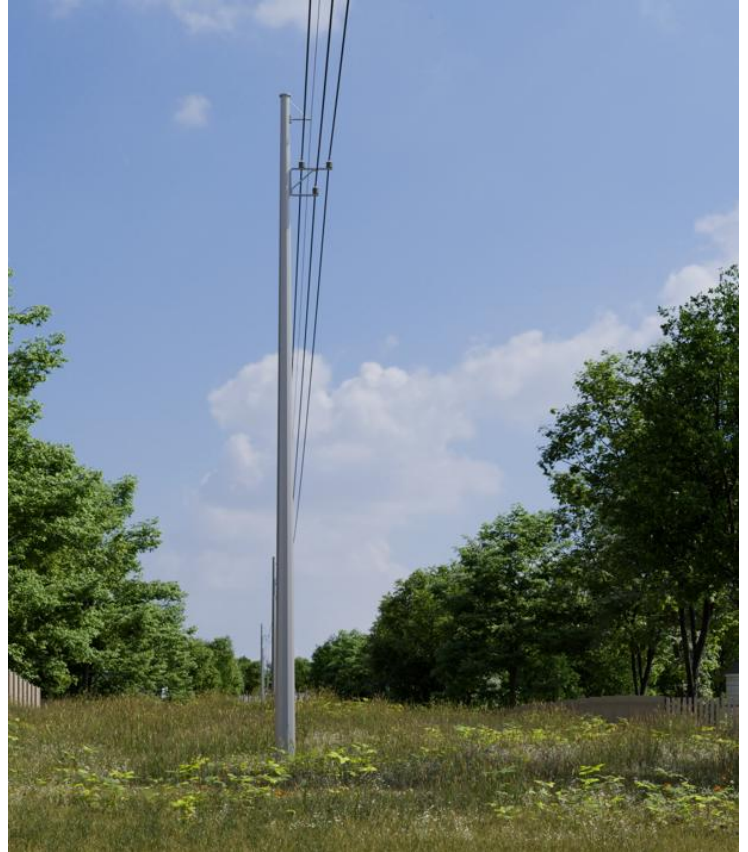
Galvanized steel poles will replace wood ones, as shown above.