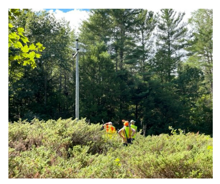
CMP Transmission Line Project Team members inspect one of the structures on Section 38 in Oakland.

More than 600 applications to interconnect community solar arrays to CMP's electric system are in various stages, from initial review and studies to energization. Since late 2021, CMP has connected more than 300 megawatts (MW) of clean energy from community solar projects between 1 and 5 MWs. In many cases, distribution line upgrades or extensions are all that's needed to join the solar array to its nearest substation. However, in areas where numerous solar developments in close proximity to each other want to connect to CMP's system, this creates an interconnection cluster that requires electric grid upgrades beyond distribution lines to accommodate the additional power load.