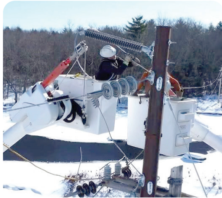
Our crews installing equipment on a new, stronger metal pole in Burnham.