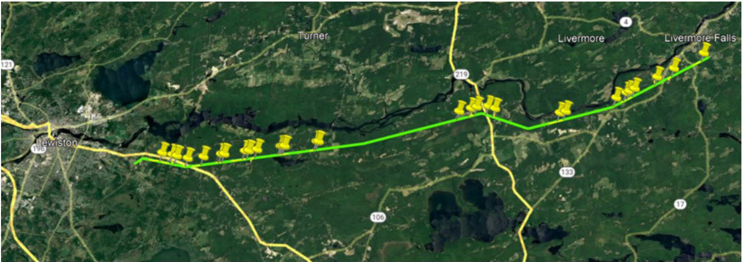
Section 200: Livermore Falls, Leeds, Greene and Lewiston – 29 locations