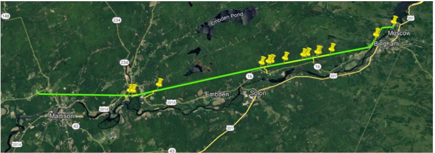
Section 63: Moscow, Concord, Embden, Anson and North Anson – 15 locations