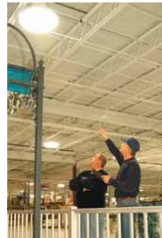
Regular evaluations of your lighting needs is key to a successful business