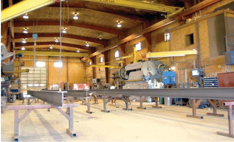
Highbay 400-watt metal halide fixtures, provide an even, well-distributed lighting pattern.

Once the actual product structure has been completed, it's ready for a finish coat. NIF's lighting for this area meets two critical requirements. First, lighting for finish coat areas must have very even light distribution to easily reveal any in-process coverage deficiencies that may affect paint adherence and quality. Second, this step of operation requires lighting for accurate color depiction. While standard metal halide lamps do a good job with color rendition, today's technology offers the option of special color corrected lamps and filters that retrofit most fixtures.