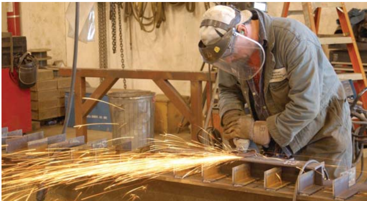
Proper lighting helps employees perform visual tasks faster and more effectively.

Once the actual product structure has been completed, it's ready for a finish coat. NIF's lighting for this area meets two critical requirements. First, lighting for finish coat areas must have very even light distribution to easily reveal any in-process coverage deficiencies that may affect paint adherence and quality. Second, this step of operation requires lighting for accurate color depiction. While standard metal halide lamps do a good job with color rendition, today's technology offers the option of special color corrected lamps and filters that retrofit most fixtures.